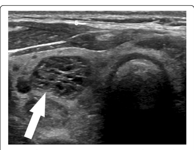
Fig. 2 Very low suspicion pattern. Transverse grayscale sonographic image of the thyroid at level of thyroid isthmus shows a nodule in the right lobe ( arrow ) with a "spongiform" pattern. Note the innumerable tiny cystic spaces characteristic of this pattern

masses. The American College of Radiology is also in the process of developing its own TI-RADS system and has proposed a lexicon for describing thyroid nodules [29]. The ATA makes specific recommendations for biopsy based on different risk categories of sonographic features paired with lesion size (Table 3). While these efforts are important steps toward standardization and determining management according to current guidelines, to date most work has involved the binary classification of nodules as benign or suspicious for malignancy. Future research must add nuance to this characterization question and aim to identify which sonographic features of nodules predict not just malignancy, but an aggressive thyroid cancer versus an indolent thyroid cancer versus a benign thyroid nodule.