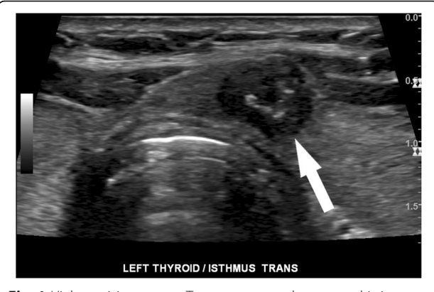
Fig. 1 High suspicion pattern. Transverse grayscale sonographic image of the thyroid at level of isthmus shows a hypoechoic, irregularly marginated thyroid nodule containing microcalcifications ( arrow ). This is a "high suspicion" sonographic pattern in the 2015 ATA guidelines, with an estimated risk of malignancy of >70–90%. Fine-needle aspiration of this nodule showed papillary thyroid carcinoma

Recent efforts have been made to standardize reporting of thyroid nodule findings and help stratify risk of malignancy [22], some of which have been described as a Thyroid Imaging Reporting and Data System [27, 28] (TI-RADS) analogous to BI-RADS for cataloguing breast